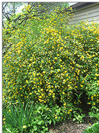
Double Flowered Japanese Kerria