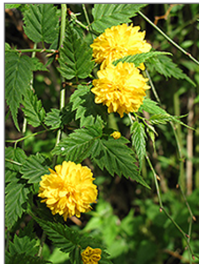
Double Flowered Japanese Kerria flowers

Double Flowered Japanese Kerria is recommended for the following landscape applications;