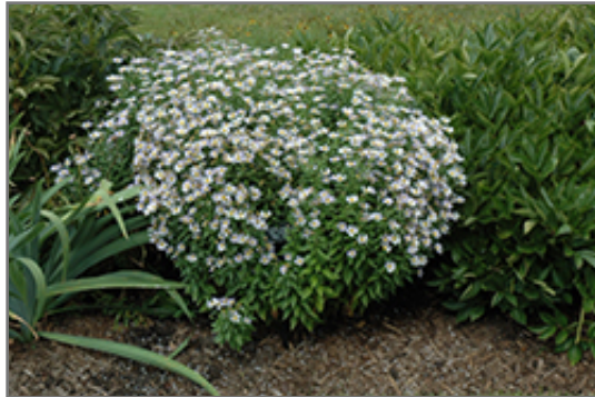
Jim Crockett Boltonia in bloom