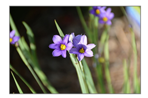
Devon Skies Blue-Eyed Grass flowers

Devon Skies Blue-Eved Grass is recommended for the following landscape applications;