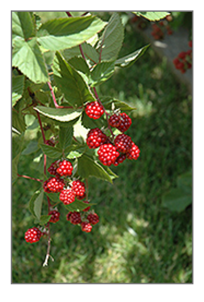
Heritage Raspberry fruit

Heritage Raspberry has rich green deciduous foliage on a plant with an upright spreading habit of growth. The fuzzy oval compound leaves do not develop any appreciable fall color. It features an abundance of magnificent red berries from early summer to early fall.