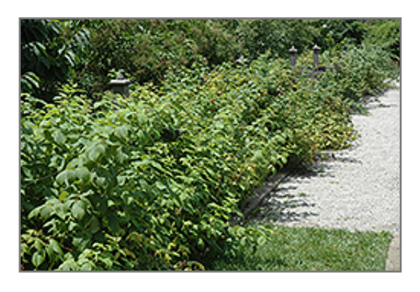
Heritage Raspberry