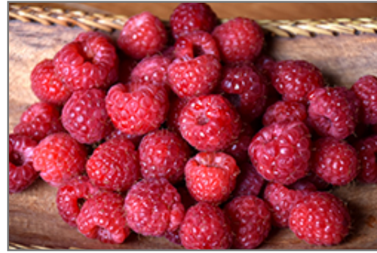
Heritage Raspberry fruit

Aside from its primary use as an edible, Heritage Raspberry is sutiable for the following landscape applications;