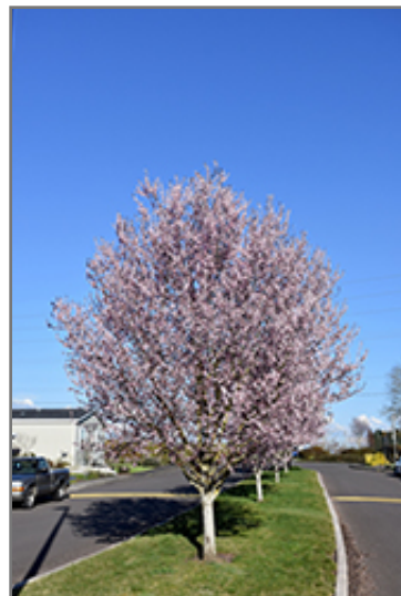
Krauter Vesuvius Plum in bloom