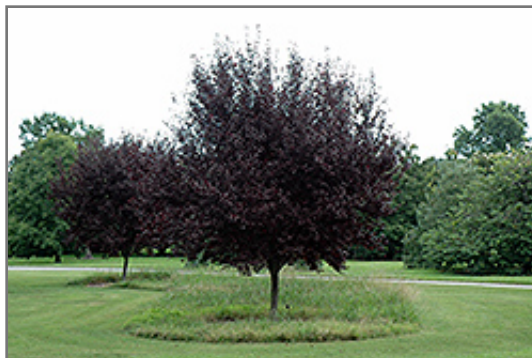
Krauter Vesuvius Plum

This tree should only be grown in full sunlight. It does best in average to evenly moist conditions, but will not tolerate standing water. It is not particular as to soil type or pH. It is highly tolerant of urban pollution and will even thrive in inner city environments. This is a selected variety of a species not originally from North America.