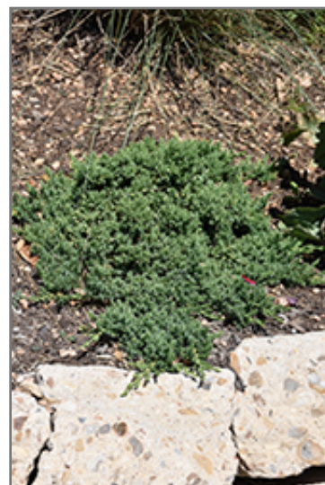
Green Mound Dwarf Japanese Juniper