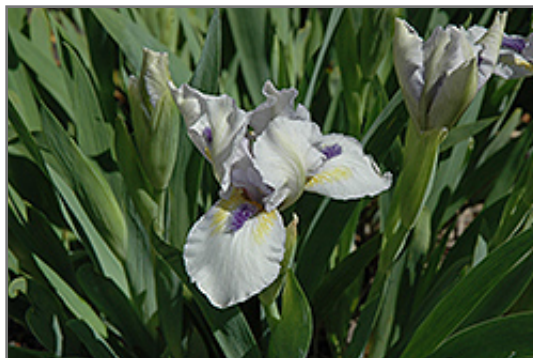
Forever Blue Iris flowers