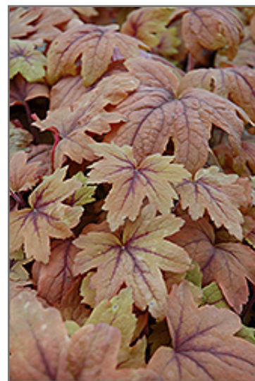
Sweet Tea Foamy Bells foliage