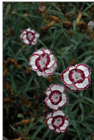
Raspberry Swirl Pinks flowers

Raspberry Swirl Pinks is recommended for the following landscape applications;