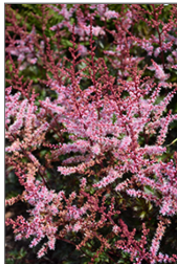
Delft Lace Astilbe flowers

This is a relatively low maintenance plant, and is best cleaned up in early spring before it resumes active growth for the season. It is a good choice for attracting butterflies to your yard, but is not particularly attractive to deer who tend to leave it alone in favor of tastier treats. It has no significant negative characteristics.