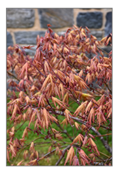
Aka Shigitatsu Sawa Japanese Maple foliage

This tree does best in full sun to partial shade. You may want to keep it away from hot, dry locations that receive direct afternoon sun or which get reflected sunlight, such as against the south side of a white wall. It prefers to grow in average to moist conditions, and shouldn't be allowed to dry out. It is not particular as to soil pH, but grows best in rich soils. It is somewhat tolerant of urban pollution, and will benefit from being planted in a relatively sheltered location. Consider applying a thick mulch around the root zone in winter to protect it in exposed locations or colder microclimates. This is a selected variety of a species not originally from North America.