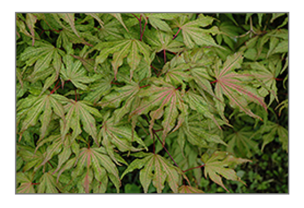
Aka Shigitatsu Sawa Japanese Maple foliage

Aka Shigitatsu Sawa Japanese Maple is recommended for the following landscape applications;