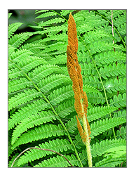
Cinnamon Fern flowers