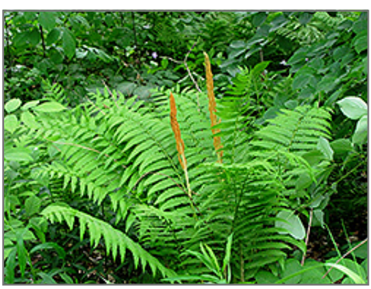
Cinnamon Fern in bloom

Cinnamon Fern is recommended for the following landscape applications;