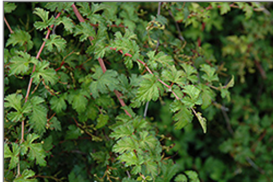
Cutleaf Stephanandra foliage