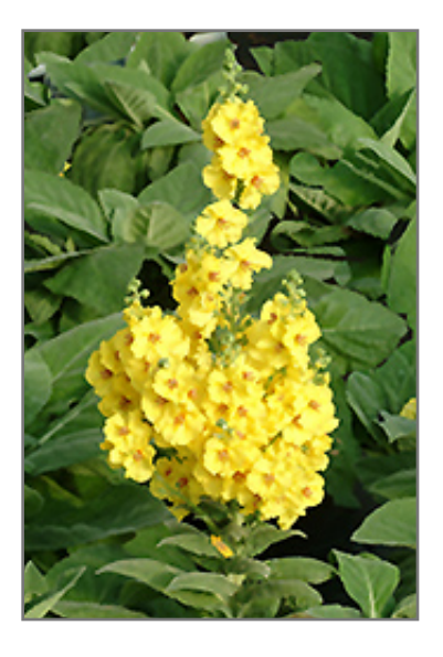
Lemon Sorbet Mullein flowers

Lemon Sorbet Mullein has masses of beautiful spikes of yellow flowers with antique red eyes rising above the foliage from mid spring to mid summer, which are most effective when planted in groupings. The flowers are excellent for cutting. Its oval leaves remain dark green in color throughout the season.