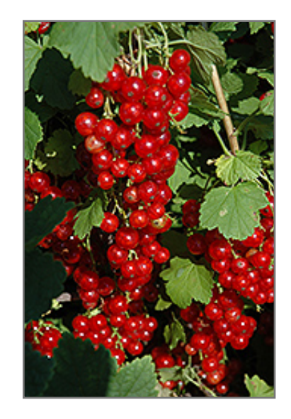
Red Lake Red Currant fruit

This is a dense multi-stemmed deciduous shrub with an upright spreading habit of growth. Its relatively fine texture sets it apart from other landscape plants with less refined foliage. This plant will require occasional maintenance and upkeep, and is best pruned in late winter once the threat of extreme cold has passed. It is a good choice for attracting birds to your yard. Gardeners should be aware of the following characteristic(s) that may warrant special consideration;