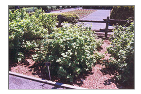
Red Lake Red Currant