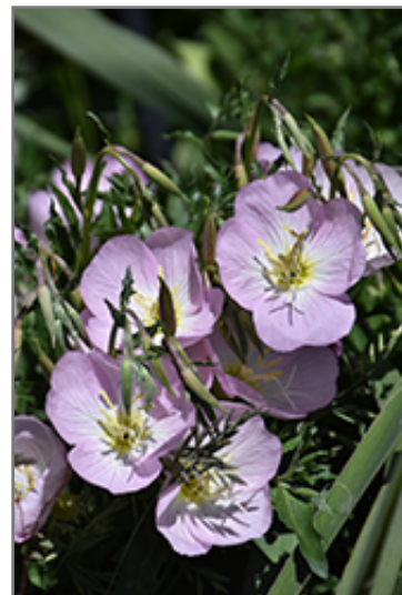
Evening Primrose flowers