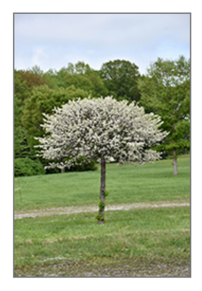
Lollipop Flowering Crab in bloom

This shrub should only be grown in full sunlight. It prefers to grow in average to moist conditions, and shouldn't be allowed to dry out. It is not particular as to soil type or pH. It is highly tolerant of urban pollution and will even thrive in inner city environments. This particular variety is an interspecific hybrid.