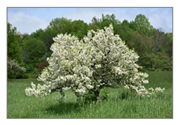
Lollipop Flowering Crab in bloom

This is a high maintenance shrub that will require regular care and upkeep, and is best pruned in late winter once the threat of extreme cold has passed. Gardeners should be aware of the following characteristic(s) that may warrant special consideration;