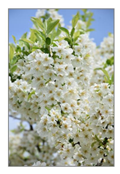
Lollipop Flowering Crab flowers