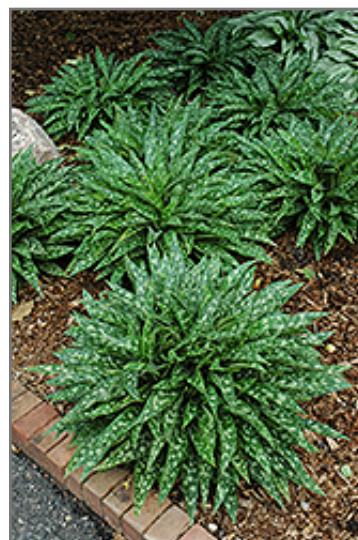
Raspberry Splash Lungwort