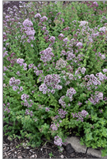
Oregano flowers