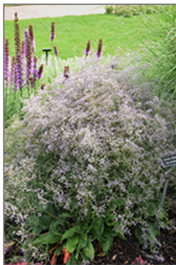
Sea Lavender in bloom