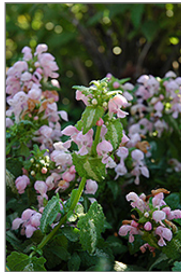
Shell Pink Spotted Dead Nettle flowers