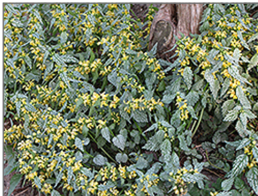
Hermann's Pride Yellow Archangel in bloom

This plant does best in partial shade to shade. It is an amazingly adaptable plant, tolerating both dry conditions and even some standing water. It is considered to be drought-tolerant, and thus makes an ideal choice for a low-water garden or xeriscape application. It is not particular as to soil type or pH. It is highly tolerant of urban pollution and will even thrive in inner city environments. This is a selected variety of a species not originally from North America. It can be propagated by division; however, as a cultivated variety, be aware that it may be subject to certain restrictions or prohibitions on propagation.