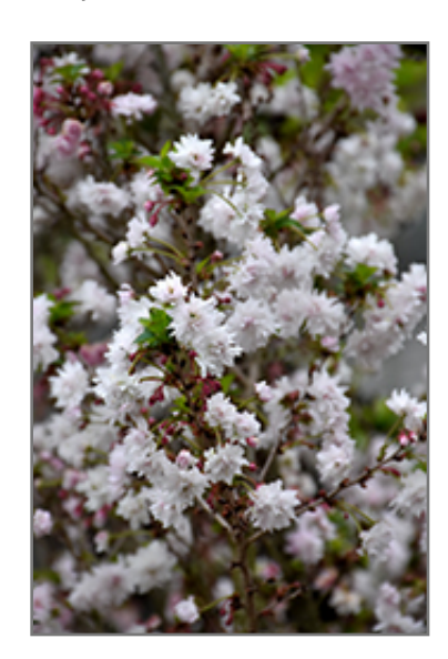
Zuzu Fuji Cherry flowers