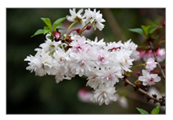
Zuzu Fuji Cherry flowers

This shrub will require occasional maintenance and upkeep, and is best pruned in late winter once the threat of extreme cold has passed. Gardeners should be aware of the following characteristic(s) that may warrant special consideration;