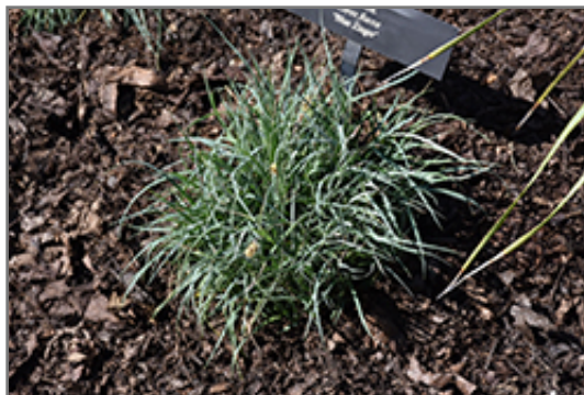
Blue Zinger Blue Sedge