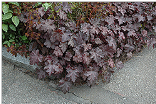
Stormy Seas Coral Bells

Stormy Seas Coral Bells is recommended for the following landscape applications;