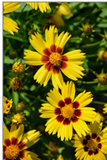
Sunkiss Tickseed flowers