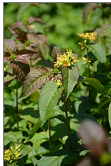
Kodiak Black Diervilla flowers