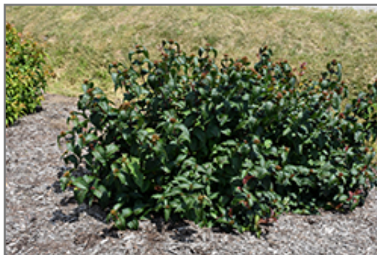
Kodiak Black Diervilla