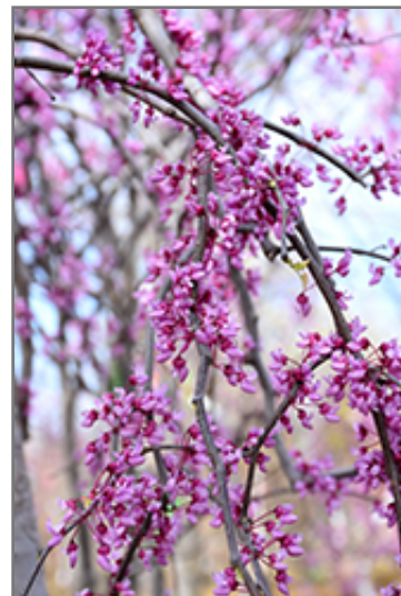
Pink Heartbreaker Redbud flowers

Pink Heartbreaker Redbud is recommended for the following landscape applications;