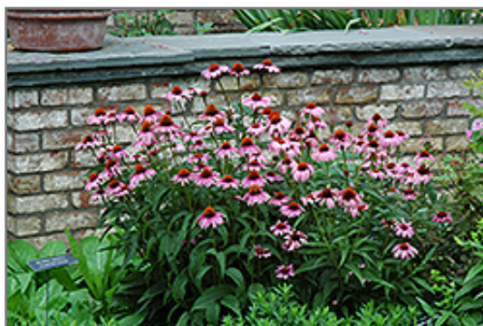
Magnus Coneflower in bloom