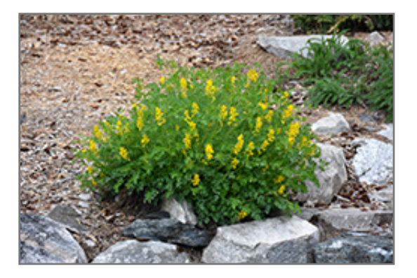
Golden Corydalis in bloom

Golden Corydalis will grow to be about 12 inches tall at maturity, with a spread of 12 inches. Its foliage tends to remain dense right to the ground, not requiring facer plants in front. It grows at a medium rate, and under ideal conditions can be expected to live for approximately 5 years. As an herbaceous perennial, this plant will usually die back to the crown each winter, and will regrow from the base each spring. Be careful not to disturb the crown in late winter when it may not be readily seen!