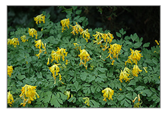
Golden Corydalis in bloom

Golden Corydalis is recommended for the following landscape applications;