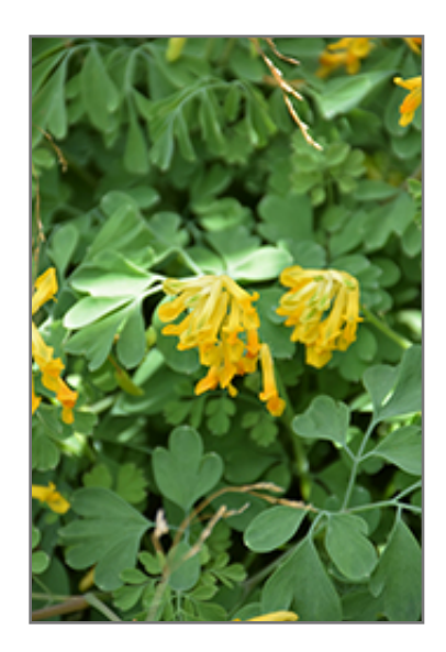
Golden Corydalis flowers