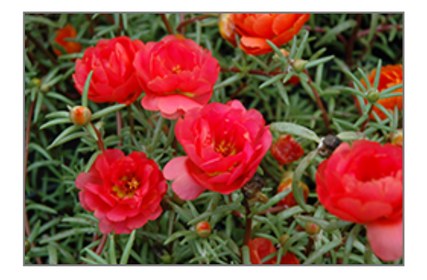
Sundial Red Portulaca flowers

Hardiness Zone: (annual) Other Names: Moss Rose Group/Class: Sundial Series