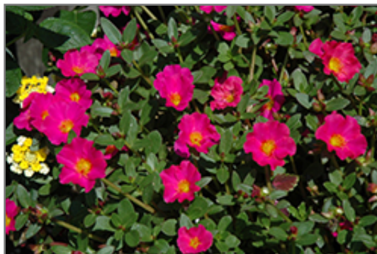
Mojave Fuchsia Portulaca flowers