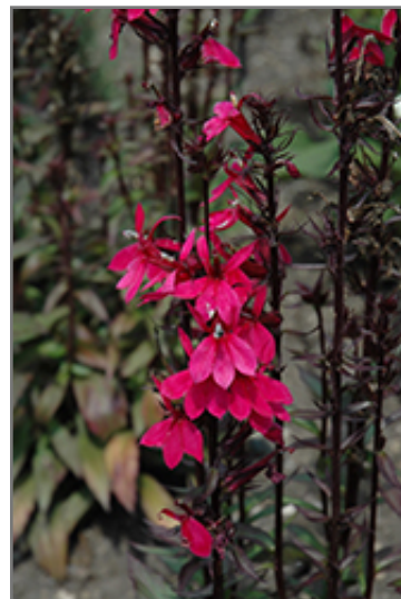
Starship Deep Rose Lobelia flowers

Starship Deep Rose Lobelia is recommended for the following landscape applications;