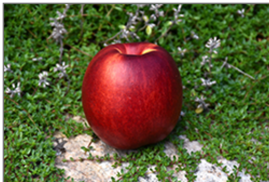
Fantasia Nectarine fruit

Fantasia Nectarine is draped in stunning clusters of fragrant pink flowers along the branches in early spring, which emerge from distinctive rose flower buds before the leaves. It has dark green deciduous foliage. The narrow leaves turn yellow in fall. The fruits are showy yellow drupes with cherry red overtones, which are carried in abundance in late summer. The fruit can be messy if allowed to drop on the lawn or walkways, and may require occasional clean-up.