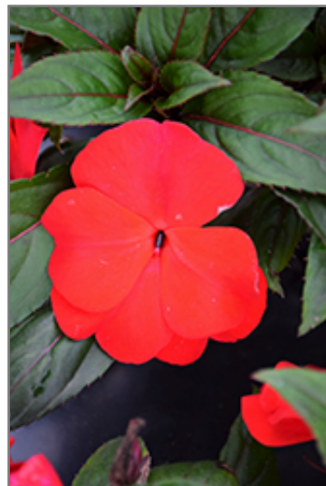
Divine Scarlet Bronze Leaf New Guinea Impatiens flowers

Divine Scarlet Bronze Leaf New Guinea Impatiens is recommended for the following landscape applications;