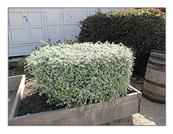
Licorice Plant