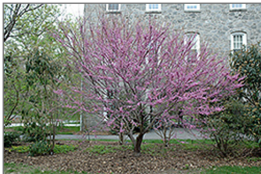
Ace Of Hearts Redbud in bloom

Ace Of Hearts Redbud is recommended for the following landscape applications;