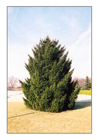
Oriental Spruce

Oriental Spruce will grow to be about 60 feet tall at maturity, with a spread of 25 feet. It has a low canopy, and should not be planted underneath power lines. It grows at a slow rate, and under ideal conditions can be expected to live for 70 years or more.