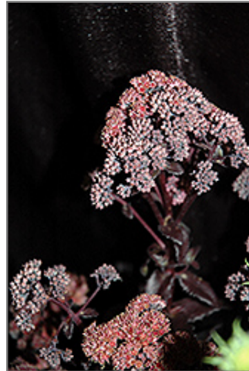
Orbit Bronze Stonecrop flowers