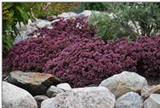
Cherry Tart Stonecrop in bloom

Cherry Tart Stonecrop is a dense herbaceous perennial with an upright spreading habit of growth. Its medium texture blends into the garden, but can always be balanced by a couple of finer or coarser plants for an effective composition.