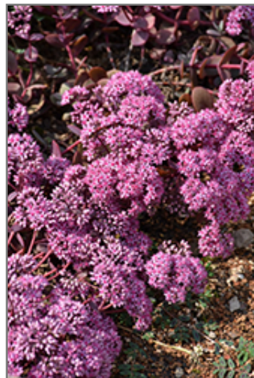
Cherry Tart Stonecrop flowers

Cherry Tart Stonecrop is a fine choice for the garden, but it is also a good selection for planting in outdoor pots and containers. It is often used as a 'filler' in the 'spiller-thriller-filler' container combination, providing a mass of flowers and foliage against which the larger thriller plants stand out. Note that when growing plants in outdoor containers and baskets, they may require more frequent waterings than they would in the yard or garden.