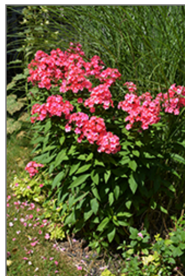
Flame Coral Garden Phlox in bloom