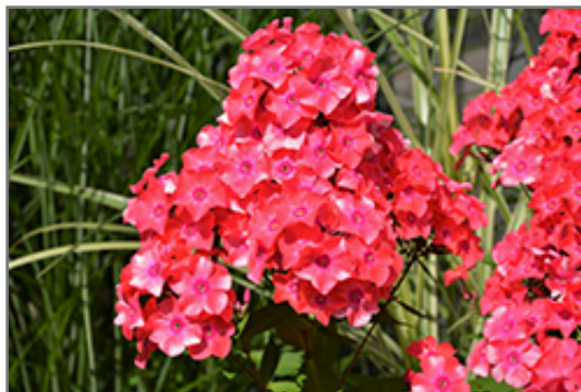
Flame Coral Garden Phlox flowers