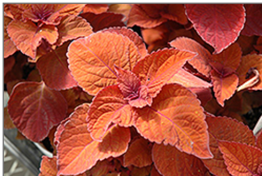
ColorBlaze Keystone Kopper Coleus foliage