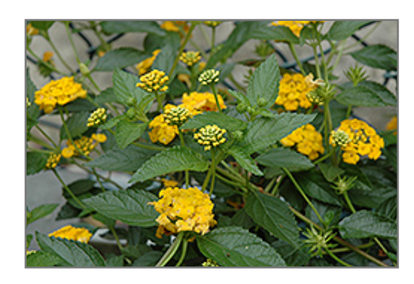
New Gold Lantana flowers

New Gold Lantana features showy cymes of gold flowers at the ends of the branches from early summer to mid fall. Its tomentose pointy leaves remain green in color throughout the year.