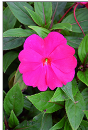
Divine Violet New Guinea Impatiens flowers

Divine Violet New Guinea Impatiens is recommended for the following landscape applications;