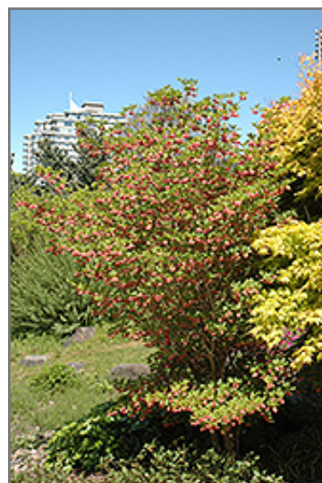
Redvein Enkianthus in bloom