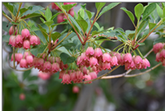
Redvein Enkianthus flowers