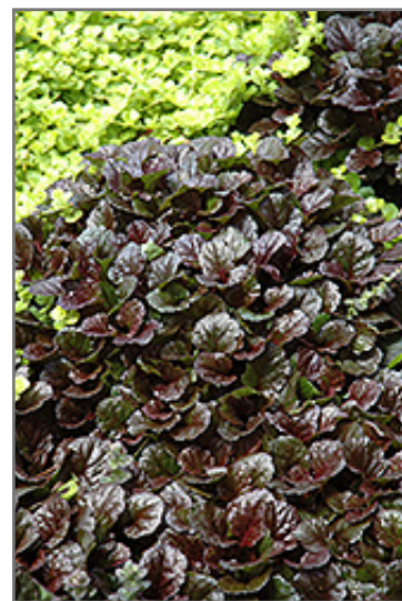
Black Scallop Bugleweed