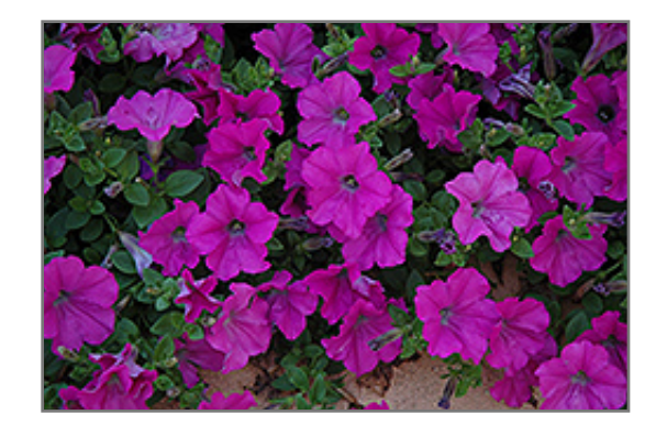
Wave Lavender Petunia flowers

Hardiness Zone: (annual) Group/Class: Wave Series