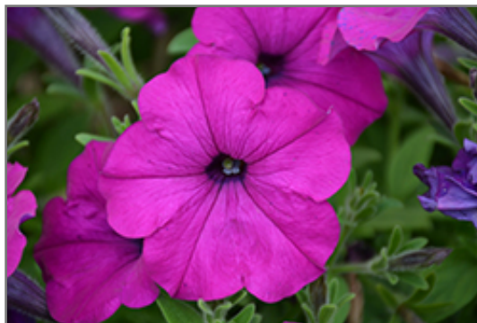
Easy Wave Violet Petunia flowers

This plant will require occasional maintenance and upkeep. Trim off the flower heads after they fade and die to encourage more blooms late into the season. It is a good choice for attracting bees and hummingbirds to your yard, but is not particularly attractive to deer who tend to leave it alone in favor of tastier treats. It has no significant negative characteristics.