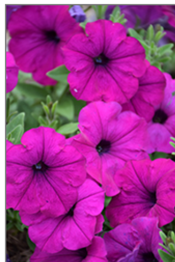
Easy Wave Violet Petunia flowers