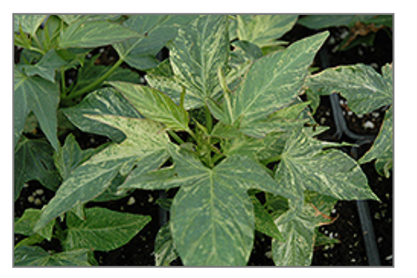
Sweet Caroline Green Yellow Sweet Potato Vine foliage

Sweet Caroline Green Yellow Sweet Potato Vine is a dense herbaceous annual with a trailing habit of growth, eventually spilling over the edges of hanging baskets and containers. Its medium texture blends into the garden, but can always be balanced by a couple of finer or coarser plants for an effective composition.