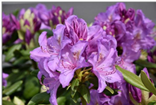
Boursault Rhododendron flowers